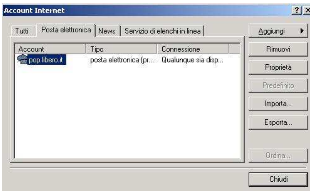
Figure 2: settings